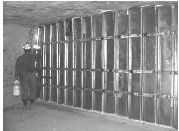
Figure 3. Nearly completed Kennedy steel stopping showing the back side of the panels attached to the horizontal steel angle bars

The stoppings were constructed on level concrete foundations in X-6 and X-7. Since the LLEM installation required the use of panel heights in excess of 1.5 m (5 ft), three rows of steel angle bars, extending horizontally from one rib to the other, were required as per the manufacturer's Instruction Guide. Figure 3 shows the nearly completed steel panel stopping in X-6 as shown from the B-drift side. The steel angles were positioned into small holes that were cut into each rib. The angle bars were located at 0.6, 1.0, and 1.7 m (22, 39, and 68 in) from the mine floor in accordance with the manufacturer's specifications.