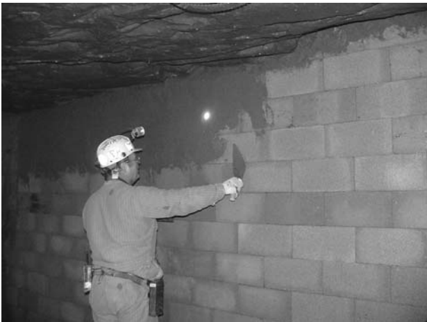
Figure 2. Miner applying sealant to concrete block stopping

After the completion of the explosion test evaluation and the removal of the first set of stoppings, additional concrete block stoppings were constructed in X-4 and X-5 using solid concrete blocks, with nominal dimensions of 15-cm by 20-cm by 40-cm (6-in by 8-in by 16-in). These stoppings were constructed in the same manner as the previously evaluated hollow-core concrete block stoppings.