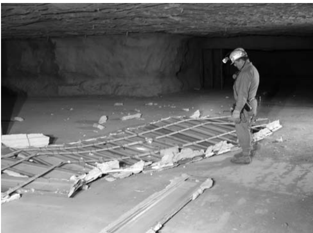
Figure 7 – Debris from the X-6 steel panel stopping after LLEM test #458, looking toward B-drift

During test #458, the steel panel stoppings in X-6 and X-7 were destroyed by the explosion. The maximum total pressure measured at X-6 was 9 kPa (1.3 psi). The interpolated static pressure was 8 kPa (1.2 psi) at the X-6 stopping location. The B-drift pressure behind the stopping in X-6 was near zero until after the stopping was destroyed. The debris from the destroyed X-6 steel panel stopping is shown in Figure 7. The stopping in X-6 was displaced from its original position as a unit.