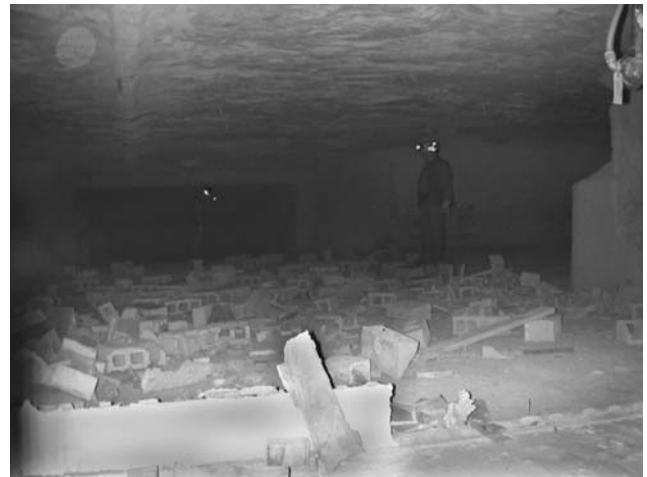
Figure 5 – Debris from block stopping in X-4 after LLEM test #428, looking toward B-drift

between C- and B-drifts is shown by the double horizontal line in the crosscut near the bottom of the figure. Note that these pressure traces, photograph, and debris map for the X-4 hollow-core concrete block stopping are representative of the type of data collected on each of the stoppings during the three evaluation programs described in this paper. The interpolated static pressure was 23 kPa (3.4 psi) at the X-5 stopping that was also destroyed during test #428. The LVDT data showed that both the X-4 and X-5 stoppings moved more than 8 cm (3-in or the maximum displacement that can be measured by the sensor) as they were destroyed.