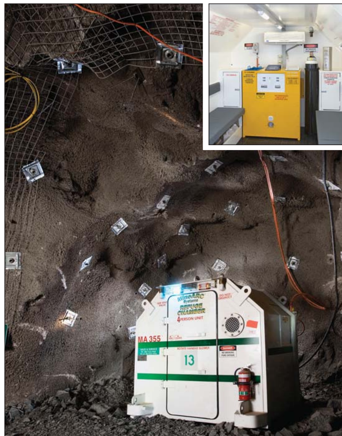
A hard-rock refuge chamber, identical to that which was used in yesterday's at Leinster's underground rockfall. Top right: Inside the refuge chamber.

According to the manufacturer of the refuge chamber, underground coal mines should also use the technology to save lives.