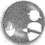
Fire and Rescue Safety