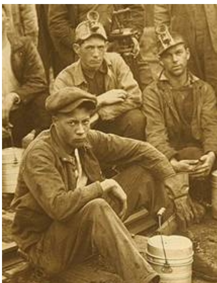
Hawk's Nest Tunnel workers, West Virginia, 1930-1931.