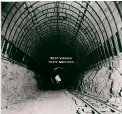
Hawk's Nest Tunnel construction, West Virginia, 1930-1931.

there was no danger to the community; there was. Government investigators established that there were hazards, there were risks, chemicals were released and the company had systematically lied about