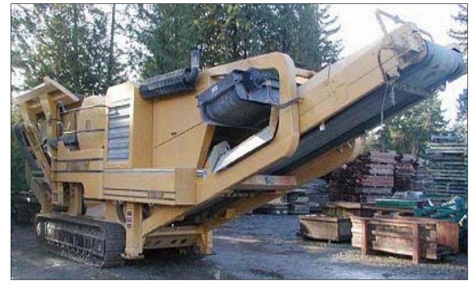
Portable rock crushing system.

On Nov. 23, 2003, a 45 year-old construction worker was killed while operating a rock crusher. The operator used a pry bar in an effort to loosen a rock jam in the intake chute, while the equipment was operating. The pry bar made contact with the impactor and was thrown out with great force, striking the operator in the neck. A