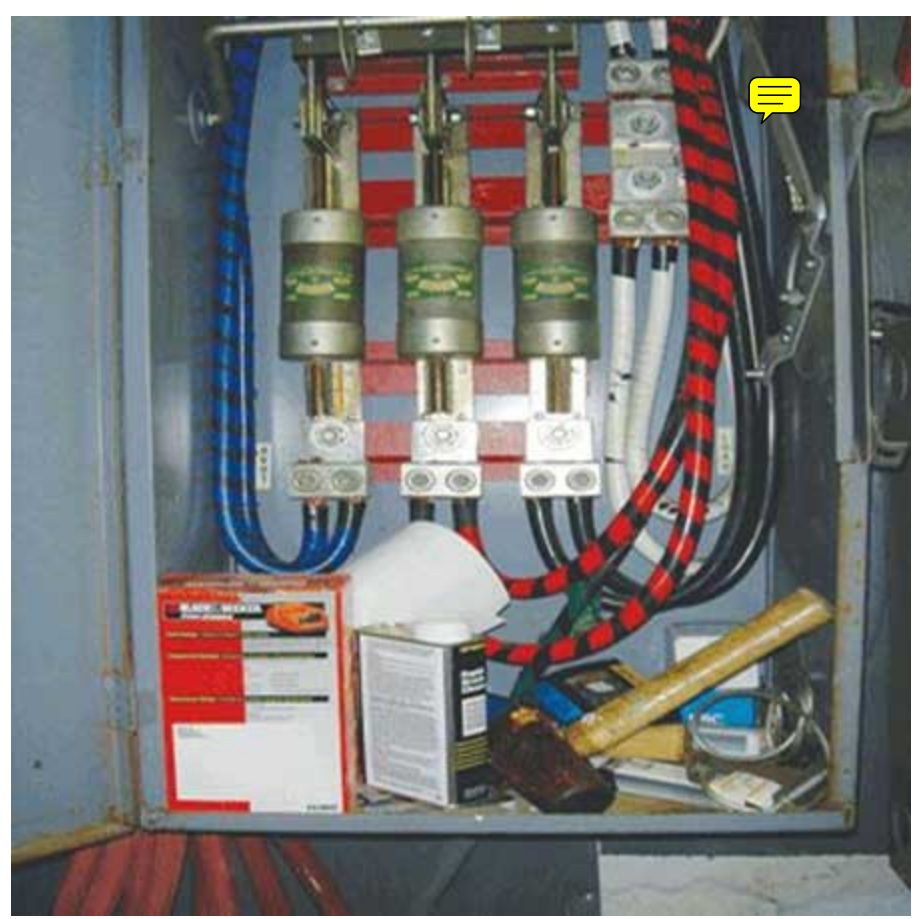
Good place to store tools.