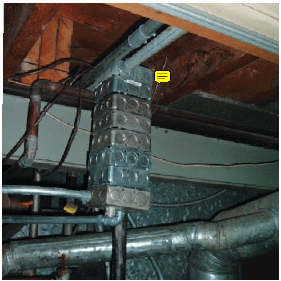
If you can't bend metal conduit, just use a few extra junction boxes!