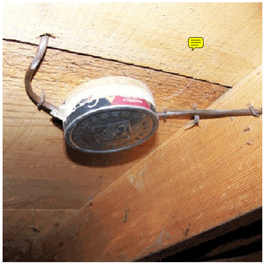
You know you're a redneck HVAC tech when you use a chew can for a junction box.