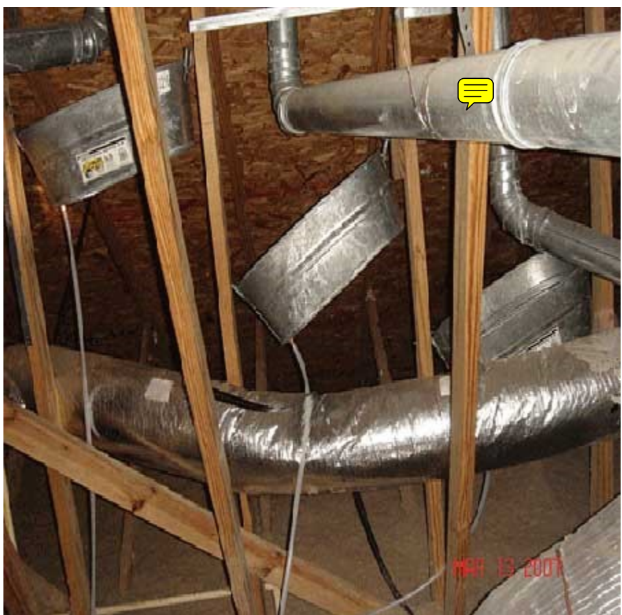
Instead of flashing the penetrations, install buckets with pipes under the drips....