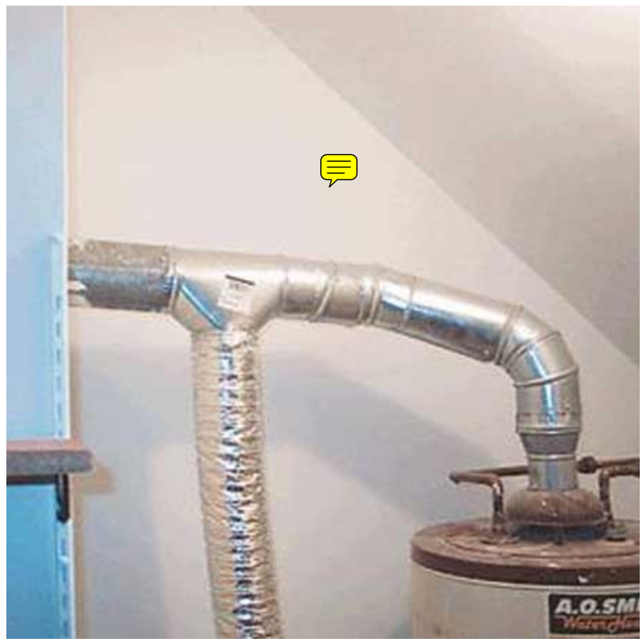
Yes- go ahead and connect the dryer vent to the WH flue.