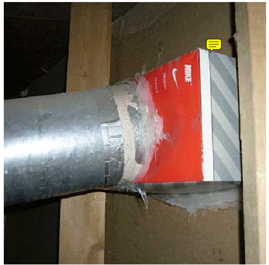
When you do not have an outlet box, use a nike box.