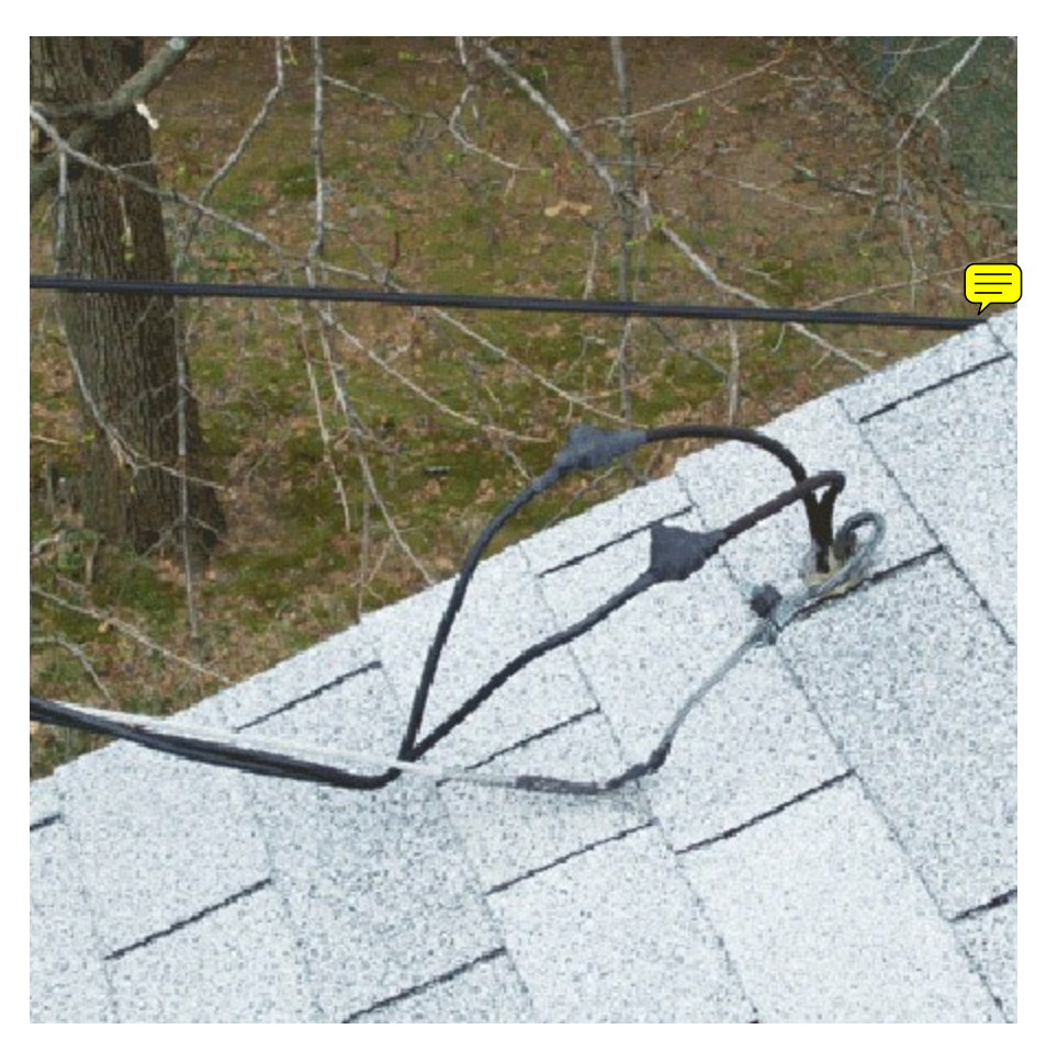
When the power company told its crew to run electricity to this house, I'm sure they didn't mean to just stick all the wires through a hole in the roof!