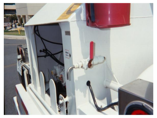
Air Activated Rear Remote Shutoff