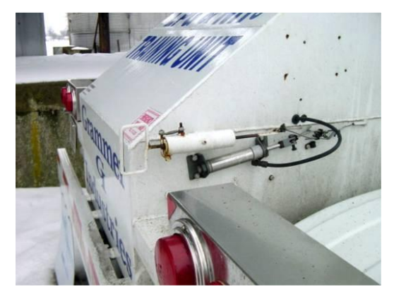
Cable Operated Remote Shutoff