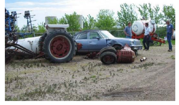
Tank split a tractor in half before coming to rest