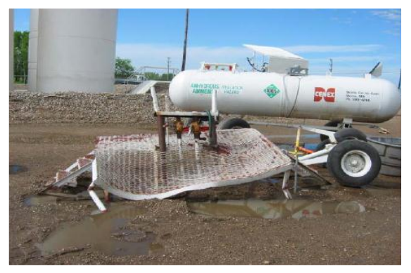
Tank ruptured and left its running gear

A 1,000 gallon tank ruptured due to an internal non-code weld that weakened the shell of the tank. After the tank ruptured, it left its running gear and crossed the yard, splitting a tractor in half and came to rest 250 feet away. Fortunately it missed other tanks and a building. It rapidly released all of its contents and the vapor cloud moved across the property.