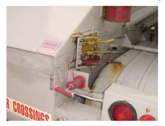
Cable Operated Rear Remote Shutoff

There are remote shut-offs for the internal valve. These are located at the driver front and passenger rear of the trailer. If something happened during the delivery, the driver or operator could engage these valves on their way when evacuating the area. Responders coming to the scene may also be able to engage these remote shut offs – and since they are at opposite ends one may be available from an upwind location. These are also actuated with fusible links. In the event of a fire, the fusible link would melt and activate either a spring that would "expand" and engage the lever or it would release air, actuating the shut-off.