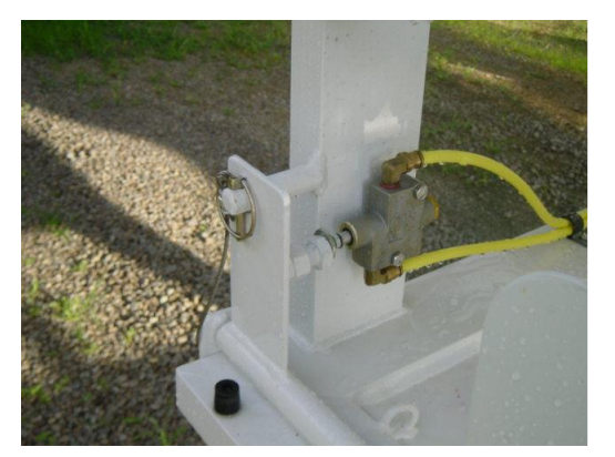
Air Brake Valve