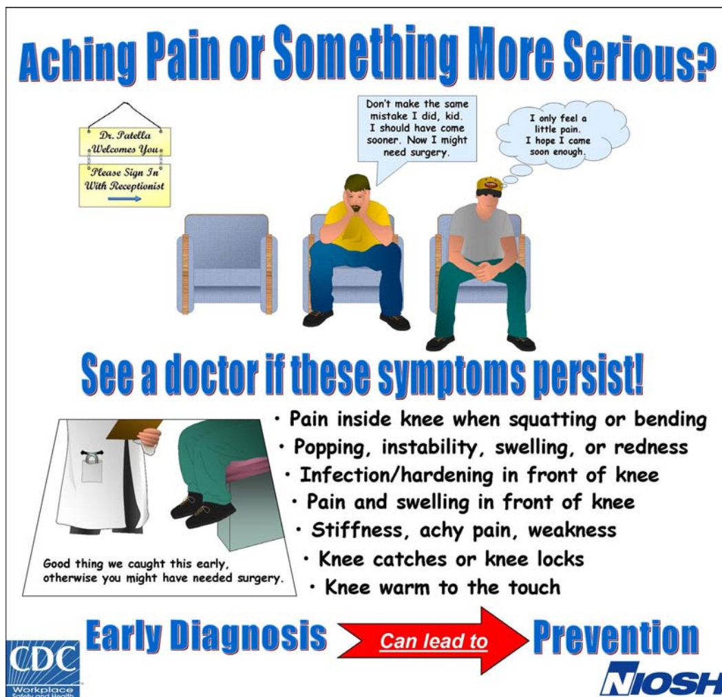
Figure 1. This is an example of a poster reinforcing the take-home message for the Symptoms of Knee Injuries module.

Supplemental materials for this module include a poster, bulletins, and a safety talk. The poster's heading is "Aching Pain or Something More Serious?" (Figure 1) and carries the message that early diagnosis can lead to prevention. There are two smaller bulletins with the same theme that can be placed where the mine workers gather together (e.g., wash-room, elevator, and change-out room). This module also includes one safety talk. The goal of this safety talk is to remind mine workers of the common symptoms and causes of knee injuries. Again, the take-home message is that early diagnosis is important. The safety talk is designed to be given by the section foreman or direct supervisor before the start of a shift. These safety talks can be used as toolbox talks. They should take only 10 minutes and provide a chance to interact with other mine workers. This interaction is important since it helps encourage peer-to-peer conversations. Each injury covered in the training is also included in the safety talk. This reminds mine workers of the symptoms and that they should see a health care provider or company physician/nurse before they worsen. Additionally, the safety talk may be taken home by the mine workers to be used for future reference.