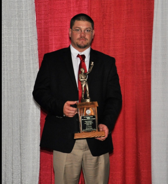
Les Ricketts River View Coal, LLC – River View Team