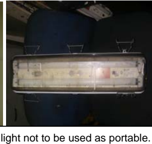
Permanent fixed light not to be used as portable.