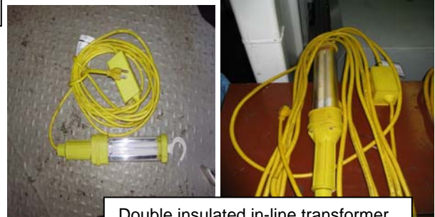
Double insulated in-line transformer.