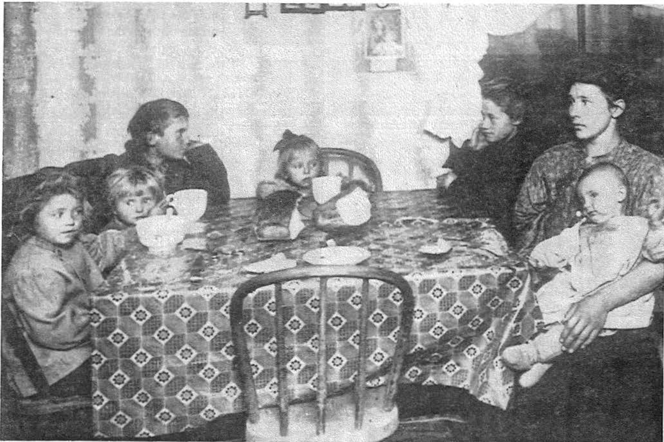
Figure 2 The empty chair belongs to one of the men who died at Cherry. His family numbered among the 607 widows and orphans left by the disaster.

These assessments are misleading, because the mine itself was highly unsafe. Both its methods of operation and layout contributed to the magnitude of the disaster. Right after the fire, in fact, an Engineering and Mining Journal reporter criticized the inadequate fire-fighting equipment at the mine. George Rice himself refrained from publicly criticizing the mine