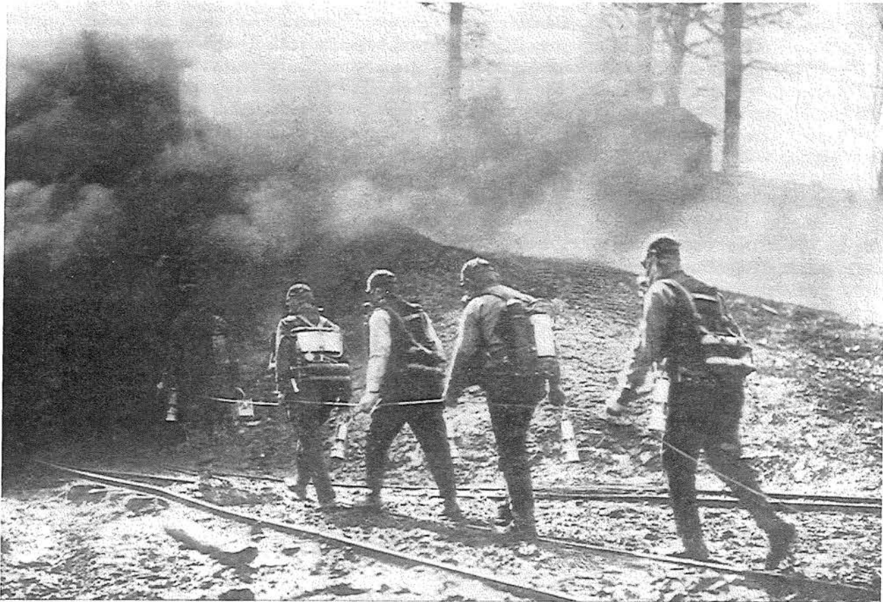
Figure 3 A U.S. Bureau of Mines rescue team enters a mine during a training exercise at the Bureau's experimental mine in Bruceton, Pennsylvania, ca. 1915.

available over the weekend to train the party that ultimately rescued the men.