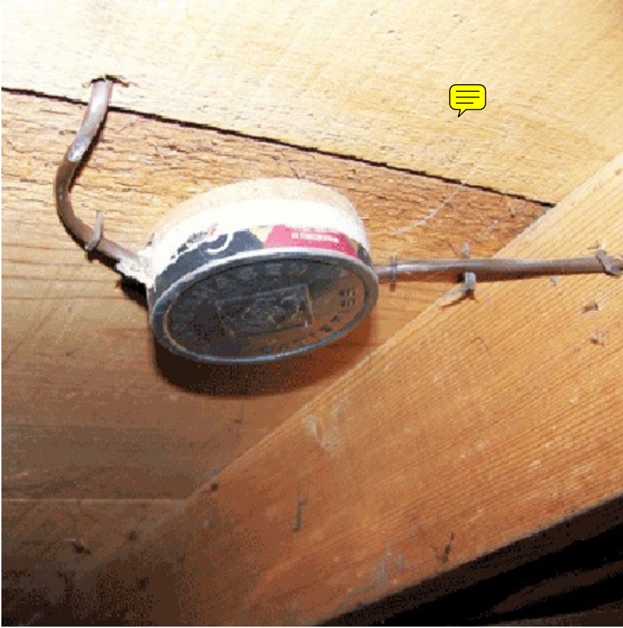
You know you're a redneck HVAC tech when you use a chew can for a junction box.