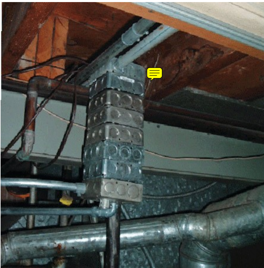
If you can't bend metal conduit, just use a few extra junction boxes!