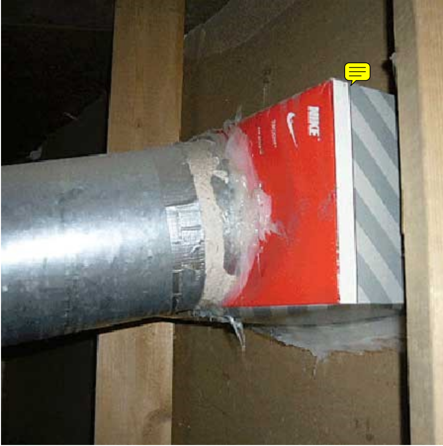
When you do not have an outlet box, use a nike box.