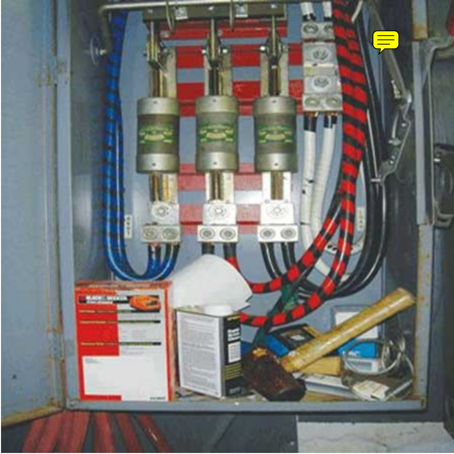
Good place to store tools.