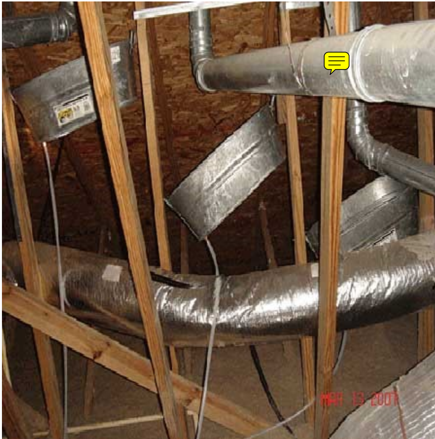
Instead of flashing the penetrations, install buckets with pipes under the drips....