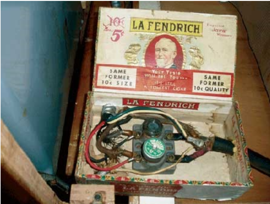
No need to ground this box. The cigar box is located under a kitchen cooktop. Fendrich was a local cigar company here in Evansville, Ind. I would call this a classic case of Indiana frugality.