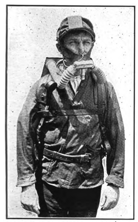
Type of apparatus carried on back of body.

The mining industry in this country employs more than a million men, and more than 3,000 are killed each year while at work. This life-saving work has now been in existence ten years or more, and the records of fatalities show that in that time the lives of 5,000 men have been saved. To state this in another way, had the fatalities been in the same proportion the last ten years as in the preceding ten years 5,000 more miners would have lost their lives.