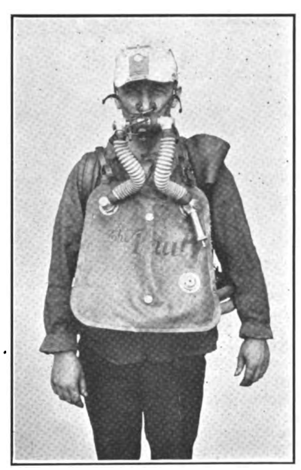
Type of apparatus carried on front of body.

ployee of the Gold Hunter Mining and Smelting Co.